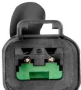
Pigtail Deutsch 2-pin