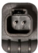
Built-in Deutsch DT-2 (2-pin)